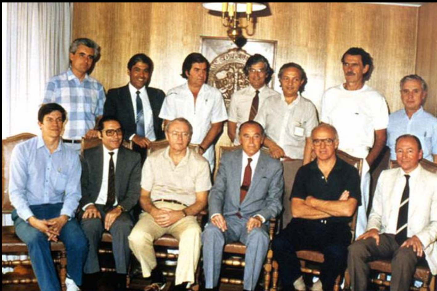
1º CURSO ATLS - CHILE 1987