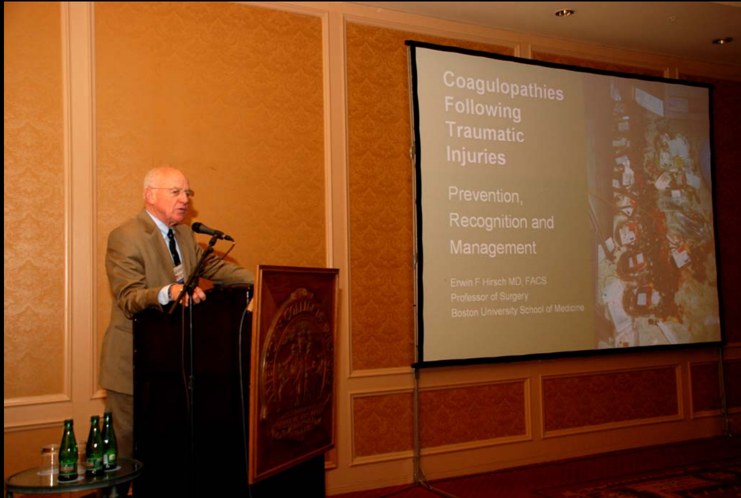
PROFESOR TITULAR de CIRUGIA UNIVERSIDAD de BOSTON 1986