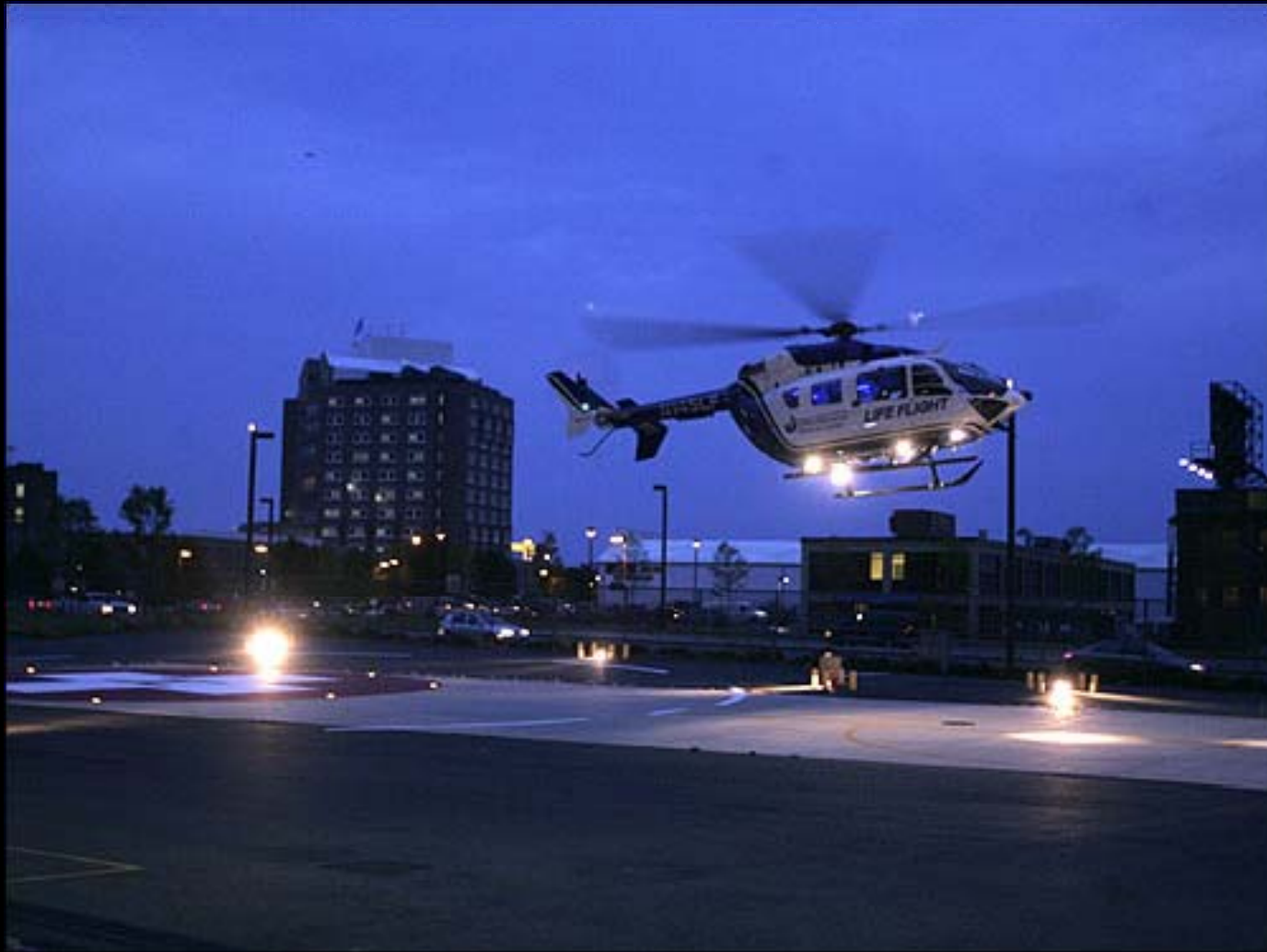
1984 BOSTON MED. FLIGHT